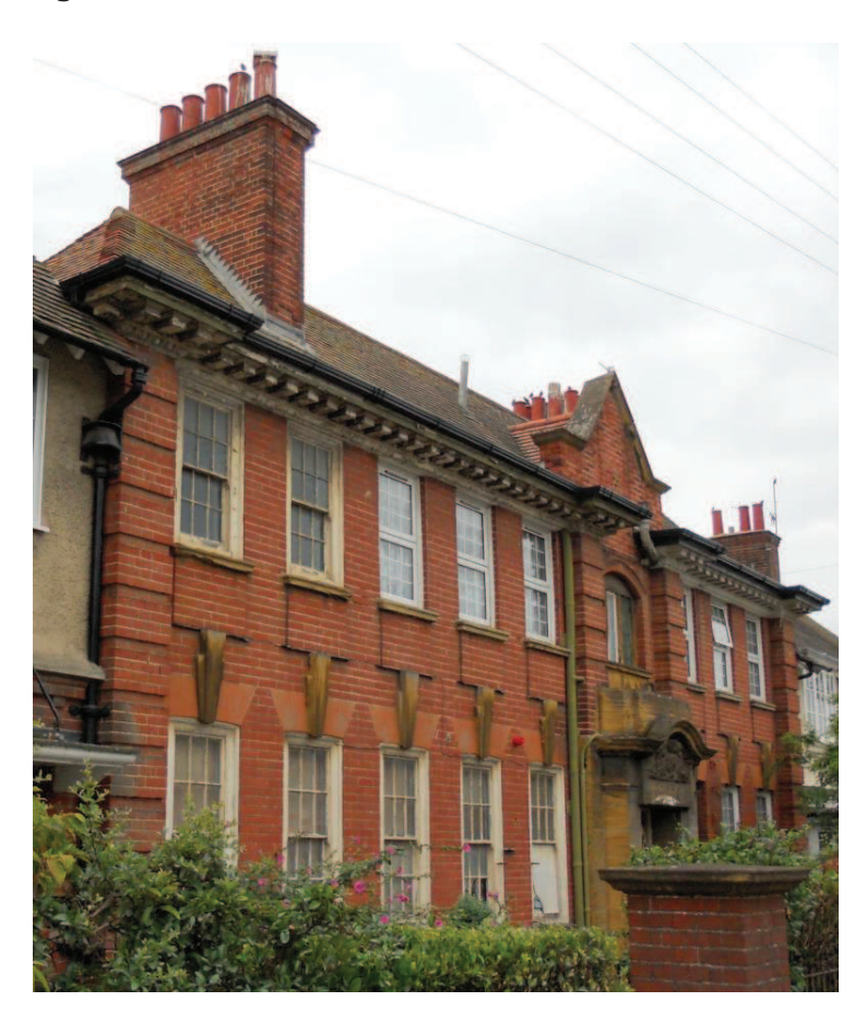
A LANDMARK BUILDING

PROPOSED COMMUNITY AND HERITAGE CENTRE BUILDING We propose that if the Old Police Station in St Andrews Road be converted to a community and heritage and community centre it could contribute to the much-needed regeneration of the area.