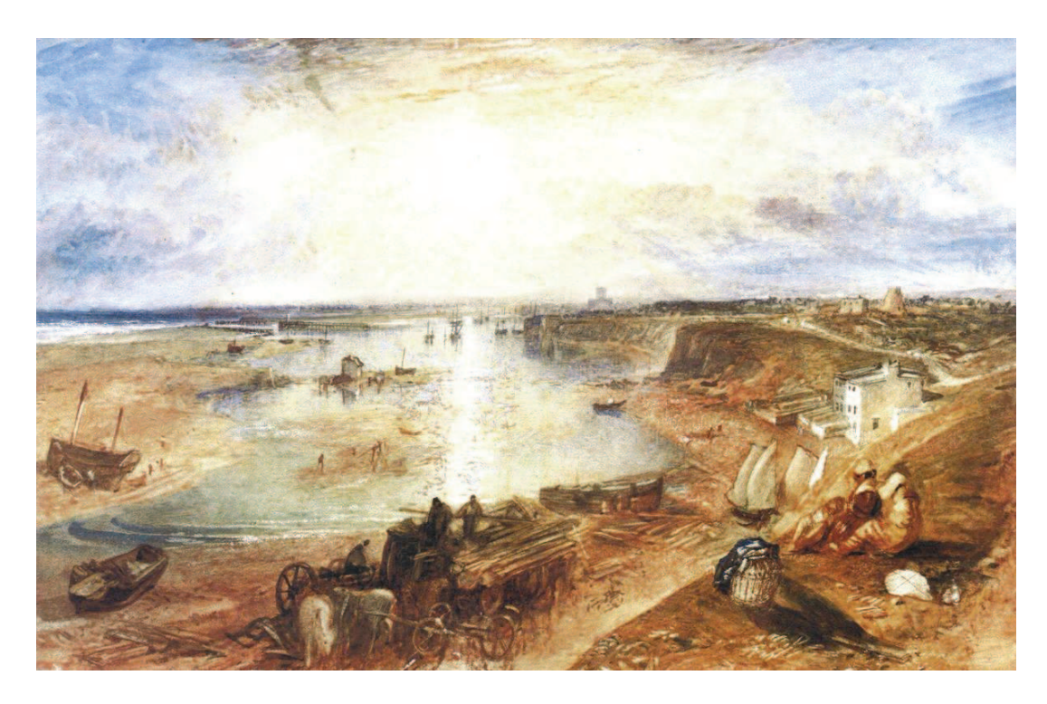
A view of the area by Turner – Early 19<sup>th</sup> Century