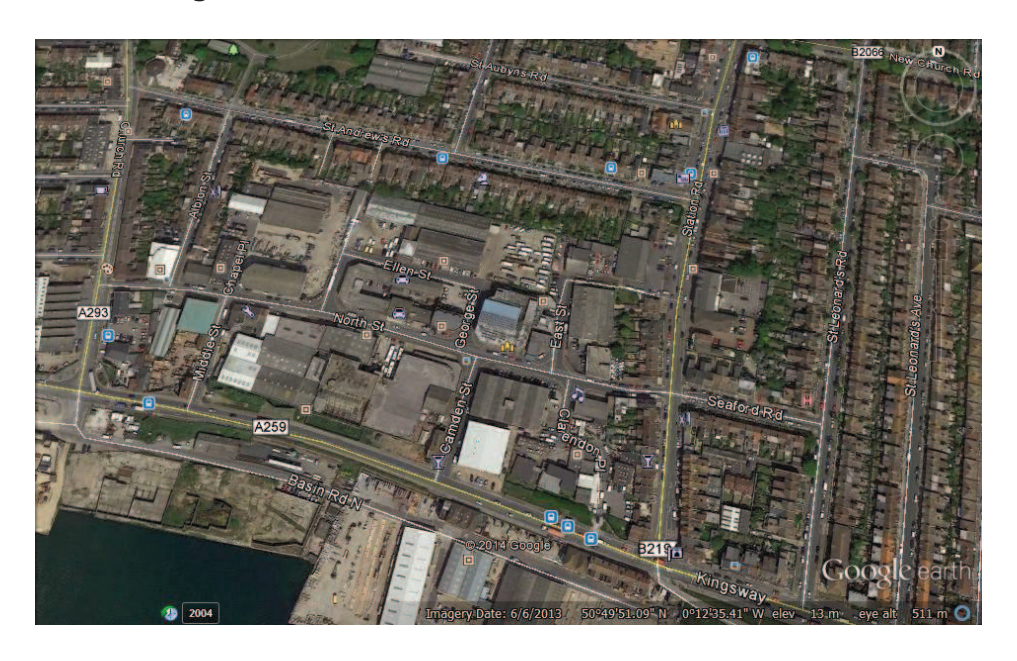
HOLLOWED-OUT SOUTH PORTSLADE FROM THE AIR

Much of Portslade is now an island of relative deprivation on the edge of the thriving and vibrant City of Brighton and Hove.