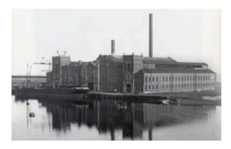
ELECTRIC LIGHT FACTORY - A GROUNDBREAKING STRUCTURE IN ITS TIME