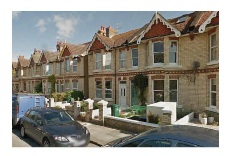
ST ANDREWS ROAD - AN ATTRACTIVE ENVIRONMENT

The Old Police Station is a building of considerable size, and alongside the decontamination unit it is testimony to the importance of Portslade during the earlier parts of the Twentieth Century.