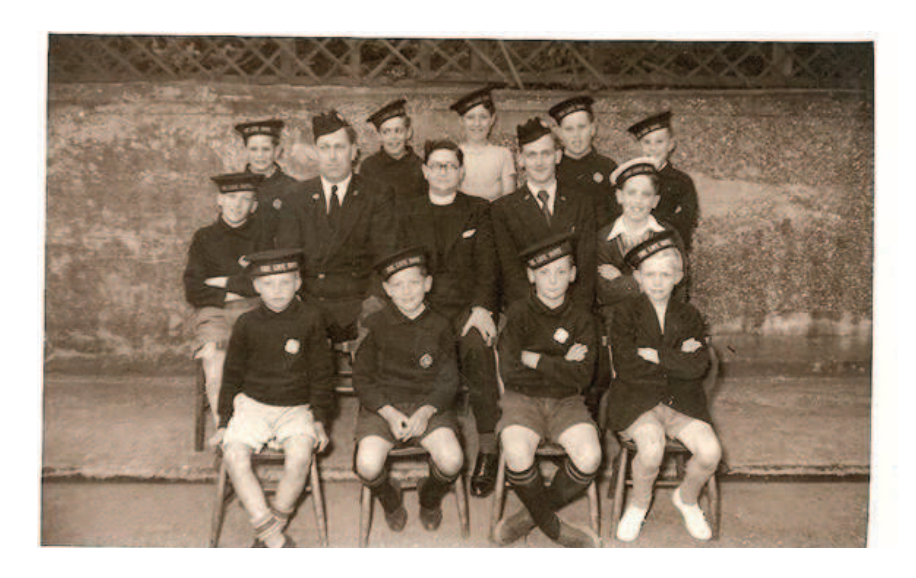
Mid-twentieth Century Children in Portslade

Much (but not all) of this has been endogenous, and it is not coincidental that both Southwick and Shoreham possess locally run community or heritage centres which have acted as catalysts for community development. Much has been achieved from within the communities.