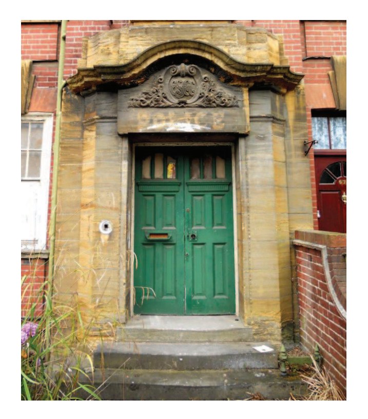
AN ICONIC DOORWAY