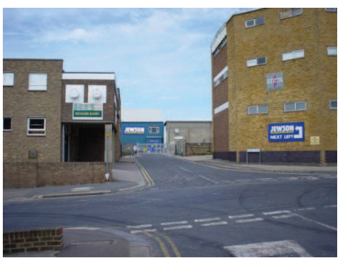
CHAPEL PLACE - THEN AND NOW!